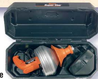
MCC Carrying Case

For Super-Vee, Power-Vee and Handylectric.