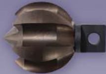
Cat # 2CG 2" ClogChopper