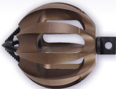
Cat # 4CG 4" ClogChopper