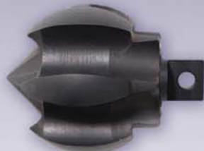
Cat # 3CG 3" ClogChopper