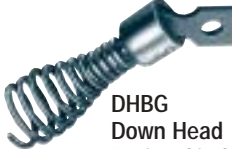
DHBG Down Head Boring Gimlet