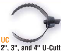
UC 2", 3", and 4" U-Cutters