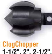
CG ClogChopper 1", 1-1/2", 2", 2-1/2", 3" and 4"