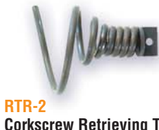
RTR-2 Corkscrew Retrieving Tool