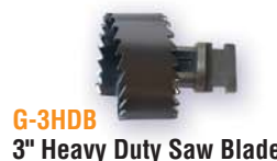
G-3HDB 3" Heavy Duty Saw Blade