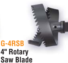
G-4RSB 4" Rotary Saw Blade