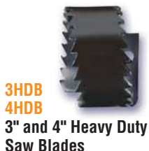
3HDB 4HDB 3" and 4" Heavy Duty Saw Blades