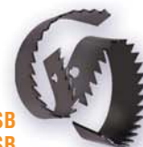
3RSB 4RSB 3" and 4" Rotary Saw Blades