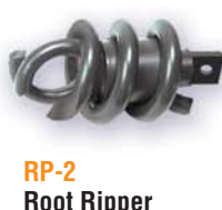
RP-2 Root Ripper