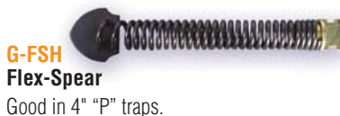
G-FSH Flex-Spear Good in 4" "P" traps.