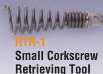
RTR-1 Small Corkscrew Retrieving Tool