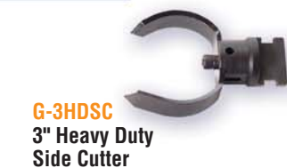
G-3HDSC 3" Heavy Duty Side Cutter