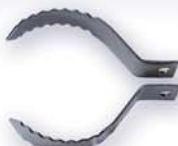
2SCB, 3SCB and 4SCB 2", 3", and 4" Side Cutter Blades