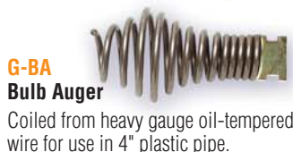
G-BA Bulb Auger Coiled from heavy gauge oil-tempered wire for use in 4" plastic pipe.