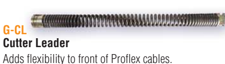
G-CL Cutter Leader Adds flexibility to front of Proflex cables.