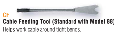
CF Cable Feeding Tool (Standard with Model 88) Helps work cable around tight bends.