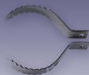
2SCB, 3SCB and 4SCB 2", 3", and 4" Side Cutter Blades