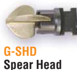
G-SHD Spear Head