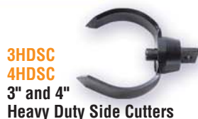
3HDSC 4HDSC 3" and 4" Heavy Duty Side Cutters