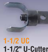
1-1/2 UC 1-1/2" U-Cutter