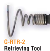
G-RTR-2 Retrieving Tool