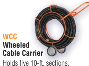
WCC Wheeled Cable Carrier Holds five 10-ft. sections.