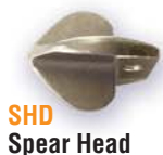
SHD Spear Head