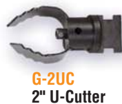
G-2UC 2" U-Cutter