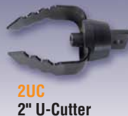
2UC 2" U-Cutter